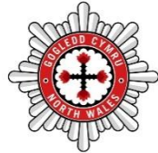
Gwasanaeth Tân ac Achub Fire and Rescue Service